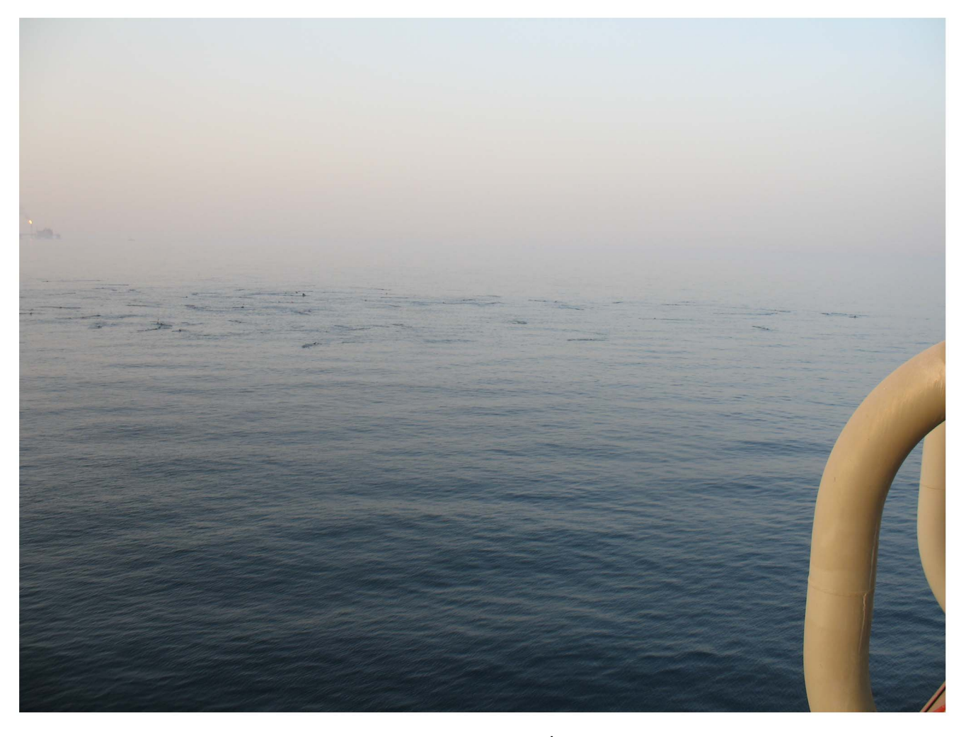
Figure 2. An image taken by Maersk Oil platform worker Soren Stig on 15<sup>th</sup> August 2007, showing an aggregation of whale sharks feeding at the surface in the Al Shaheen Oil Field. doi:10.1371/journal.pone.0058255.g002

pendent egg samples matched mackerel tuna ( Euthynnus affinis ) with 100.0% similarity.