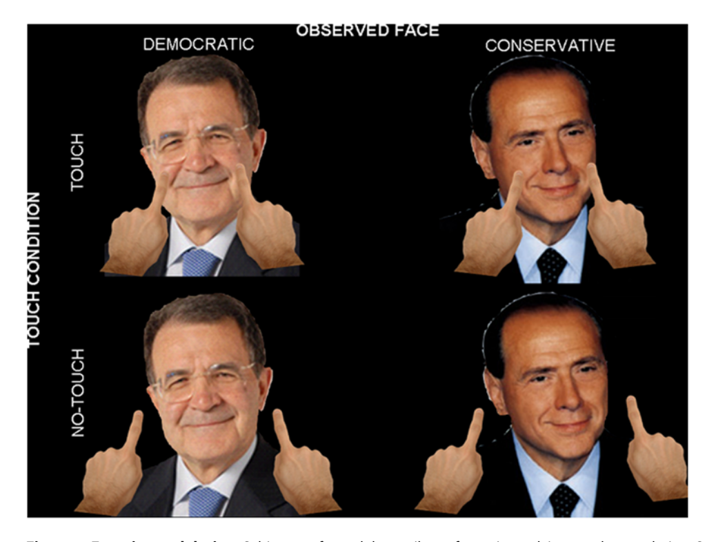
Figure 1. Experimental design. Subjects performed the tactile confrontation task in a two by two design. Over a series of trials they viewed either In-group or Out-group faces, with those groups defined by either ethnic (Experiment 1) or political (Experiment 2) similarity to the viewer. The depicted face could be touched (Touch Condition) or simply approached (No-Touch condition) by one or two fingers on either the right, left or both sides of the depicted face. Figure 1 shows examples of stimuli from Experiment 2: the face of a Democratic (on the left) and a Conservative (on the right) political leader, was either touched (on the top) or simply approached (on the bottom) by two fingers. The pictures on the left represent an Ingroup condition for a Democratic observer and an Out-group condition for a Conservative observer and vice-versa for the pictures on the right. doi:10.1371/journal.pone.0004930.g001

Subjects were instructed to ignore the side of the visual information, and to press a button with the hand corresponding to the side of the tactile stimulus on their own face. An improvement in detecting bilateral tactile stimuli modulated by visual information was taken as an index of visuo-tactile remapping. If the re-mapping mechanism is sensitive to the identity of the observed face, a stronger effect should be observed when people view touch directed towards a member of their own ethnic (Caucasian and Maghrebian) or political (Democratic and Conservative) group. Furthermore, if such modulation is a specific effect of viewing touch and not a generic arousal effect of viewing