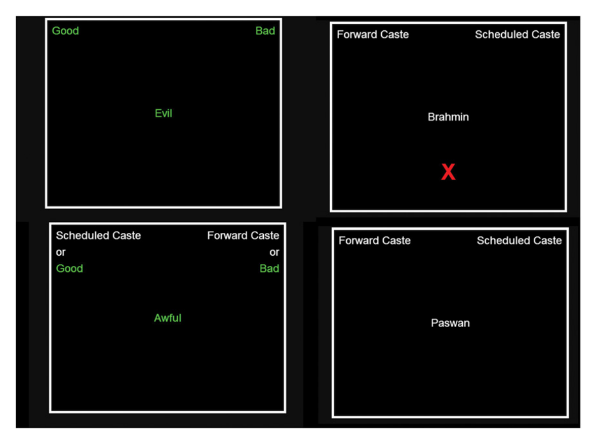
Fig 1. Screen shots from IAT. The picture shows four different screenshots from the IAT. Subjects were required to associate the words that came up with either the left or the right category.