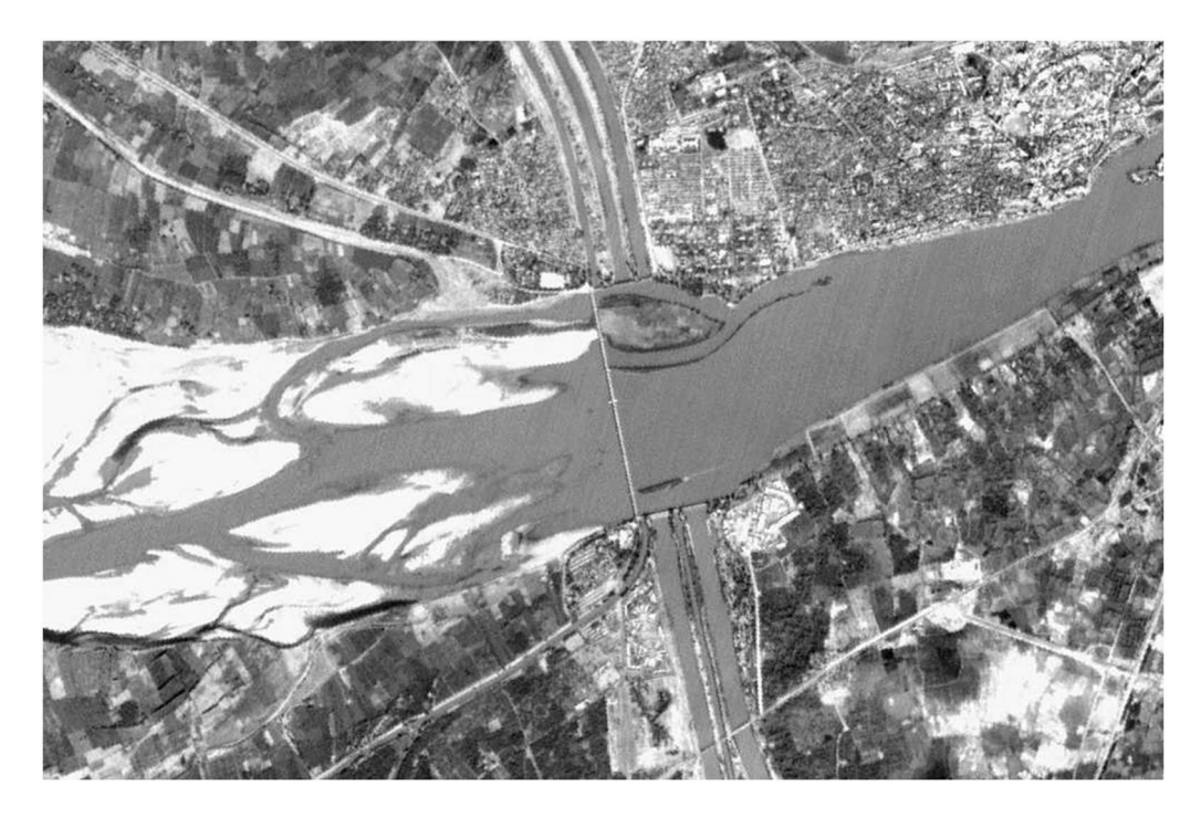
Figure 2. Aerial photograph of Sukkur Barrage. Image shows the seven canals diverting water out of the river, and demonstrates the dramatically reduced flows downstream (river flow direction right to left). doi:10.1371/journal.pone.0101657.g002

the response variable modelled using a GLM with a quasi-Poisson error distribution.