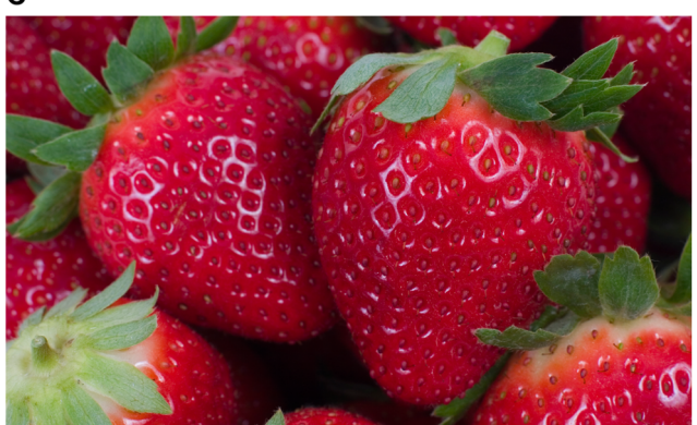
Figure 1. Photographs of strawberry production field, plants, and harvested fruits. Photographs characterizing the commercial style production and harvest standards employed in this study. Annual plasticulture of strawberry (A) is common practice in Florida production fields. Winterstar<sup>TM</sup> strawberry plants (B) bearing flowers and fruit of varying developmental stages and ripeness. Harvested fruit of cultivar 'Winter Dawn' (C) demonstrating ripeness used in study, 90–100% red. doi:10.1371/journal.pone.0088446.q001