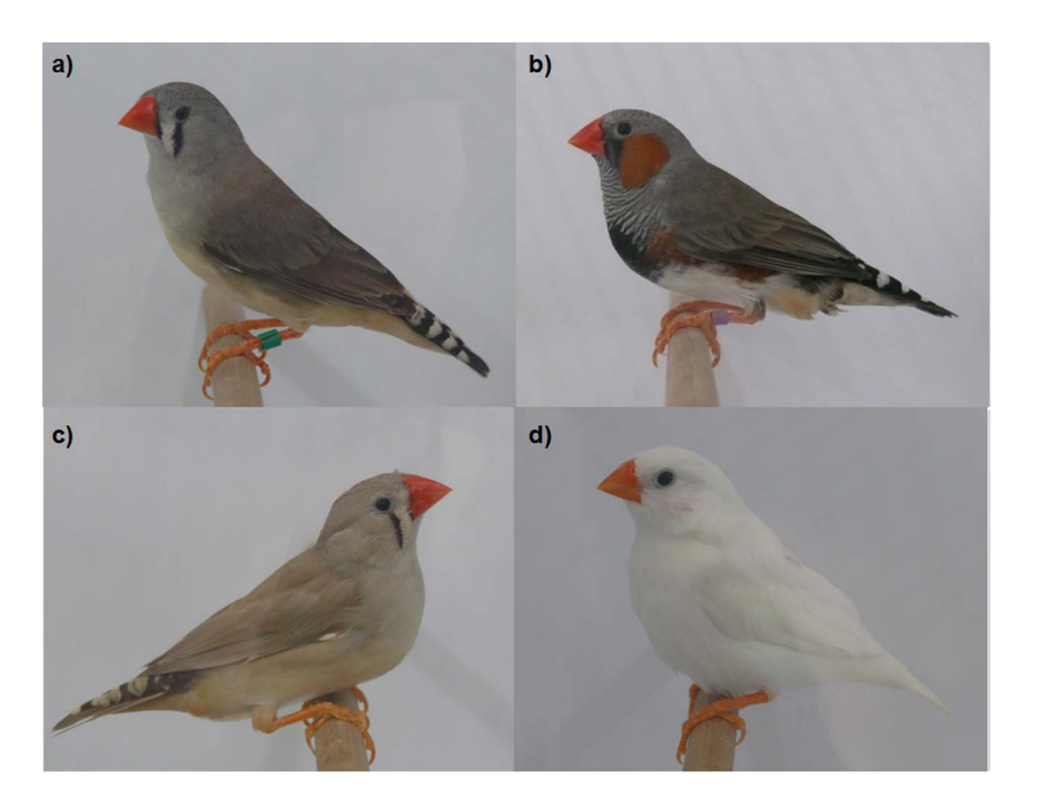
Figure 1. Examples of plumage coloration phenotypes found in zebra finches: (a) wild type (female); (b) black face (male); (c) fawn (female); and (d) white (female). We analysed the wild type and white plumage morphs for MC1R polymorphism in this study. doi:10.1371/journal.pone.0086519.q001

of the level and nature of melanisation in the feathers in comparison to the wild type phenotype.