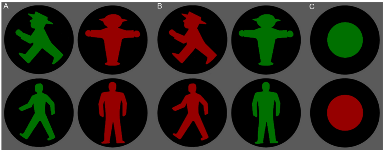
Figure 1. Ampelmännchen stimuli. A) Congruent condition: go/stop signs from East (upper panel) and West Germany (lower panel); left figures signaling “go”; right figures “stop”; B) Incongruent condition: go/stop signs with altered colors; C) Examples for control condition: color circles with same area size (number of pixels) of color as corresponding signs. doi:10.1371/journal.pone.0064712.g001