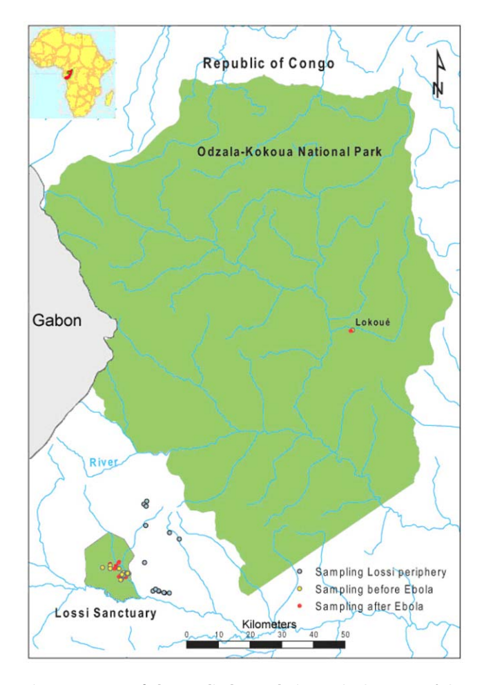
Figure 1. Map of the studied populations. The locations of the samples collected before and after Ebola outbreaks are showed. doi:10.1371/journal.pone.0008375.g001

We investigated the short term effects of Ebola outbreaks on genetic diversity and structure of the Western lowland gorilla population in the Odzala-Kokoua National Park and in the Lossi Sanctuary (Republic of the Congo, Figure 1). Thanks to the long term monitoring of theses populations, faecal samples were collected from wild gorillas before and 2 to 4 years after Ebola outbreaks and at the periphery of the sanctuary where Ebola has not been detected. 177 different individuals were genetically identified using 17 microsatellite loci. Due to the short time span between sampling events, genetic diversity is expected to be similar in pre and post-epidemic samples assuming that there is no bias in the sampling or in mortality due to Ebola and that social organisation and migration fluxes were not perturbed by the outbreaks. In order to test these hypotheses, we examined temporal changes in genetic diversity and structure in pre and post-epidemic populations. Given that gorilla share Ebola virus with humans and that viability of gorilla is threatened by this disease [2,51], understanding the influence of infectious diseases on gorilla genetic dynamics is of paramount importance for human health, evolution and conservation biology sciences.