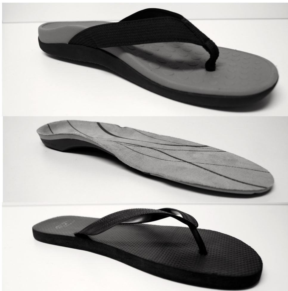
Fig 2. Contoured sandal, orthotic and the flat flip-flop intervention.