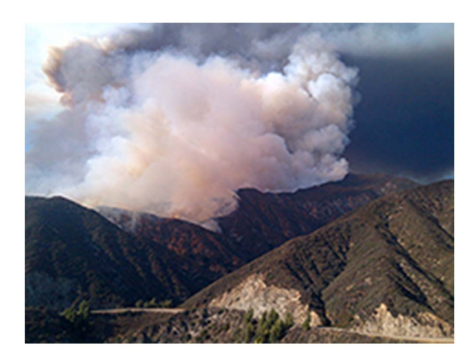
Figure 1. Photograph of the 2012 Williams Fire in Angeles National Forest, California showing the relatively remote and mountainous terrain where the fire occurred. doi:10.1371/journal.pone.0107835.g001

et al. [15] and Dunlap et al. [1], who predicted that it could take decades to centuries to flush leaded gasoline depositions from surface sediments in California's Central Valley to San Francisco Bay. Similarly, Semlali et al. [16], based on a study in France, estimated that it would take at least 700 years to reduce the amount of anthropogenic Pb accumulated in soil by 50%.