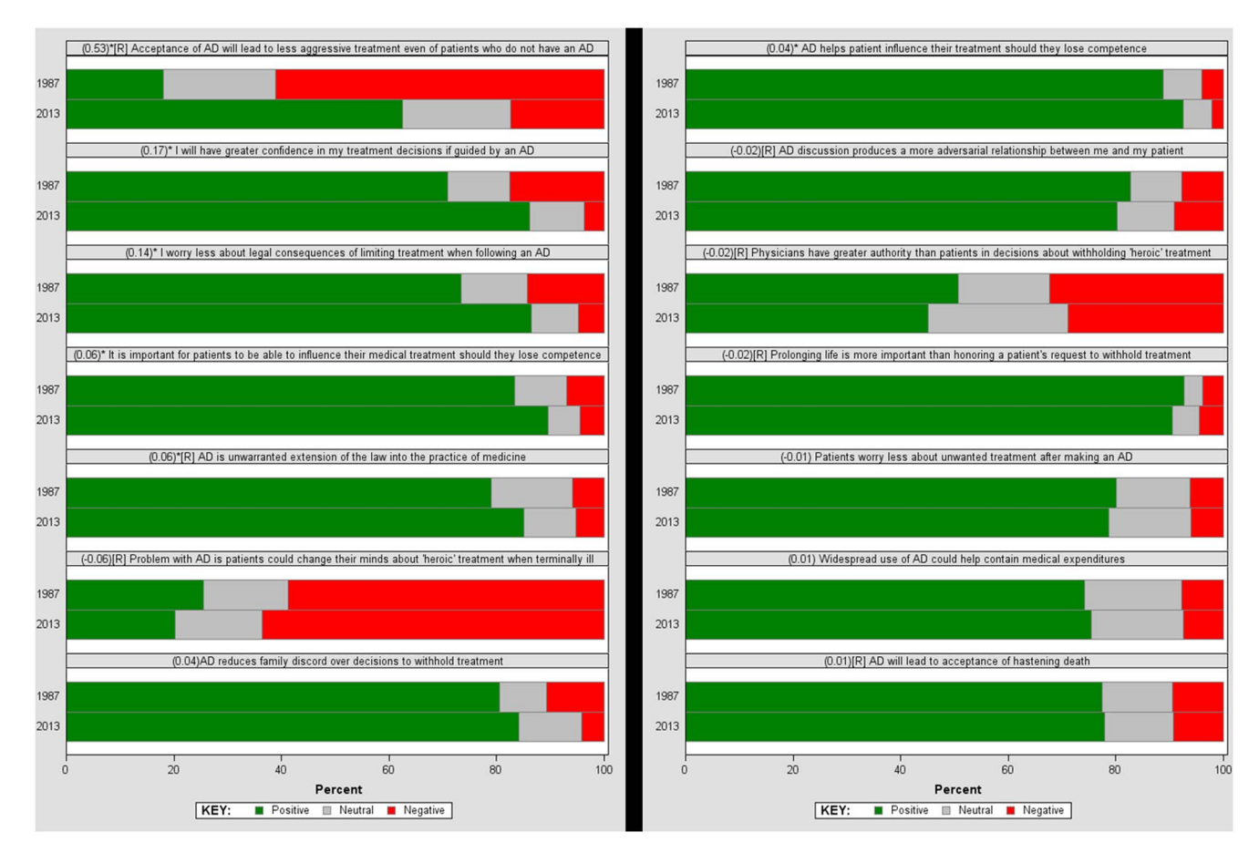
Figure 1. Comparison of the 1989 cohort to the 2013 cohort of doctors on each of the 14 statements about Advance Directives. Please note that ( ) indicates the Success Rate Difference Effect Size (-1.0 to +1.0). [R] indicates statements that oppose Advanced Directives. An asterisk sign* indicates the Mann-Whitney Wilcoxon test with the Bonferroni adjustment is significant at \alpha = 0.05/14 . doi:10.1371/journal.pone.0098246.g001

years age group ( 25^{th} percentile = 0.32, 75^{th} percentile = 0.57), p = 0.0314, and SRD = 0.078.