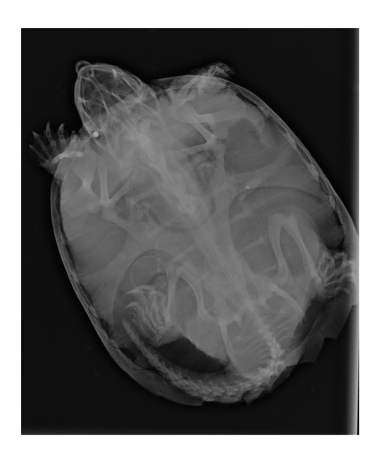
Figure 4. X-ray of a gravid Snapping Turtle ( Chelydra serpentina ) captured in Virginia containing a metal pellet in its jaw. doi:10.1371/journal.pone.0091368.g004

contained ingested fish hooks. Given the injuries associated with hook ingestion in other taxa (e.g., [16–18]), our data suggest that recreational fishing is a potential anthropogenic threat for this imperiled group. However, our study likely underestimates the total proportions of the freshwater turtle populations that ingested fishing tackle because the turtles we identified as containing hooks are only those individuals that swallowed hooks, escaped or were released by anglers, and survived the time from being hooked until time of capture in our study without expelling the hook. In addition, in areas where turtles are intensively harvested (recreationally or commercially) via baited hooks (e.g., [11]) or where fishing pressure is higher than in our study sites, the proportions of turtles with ingested hooks could be considerably higher than we observed.