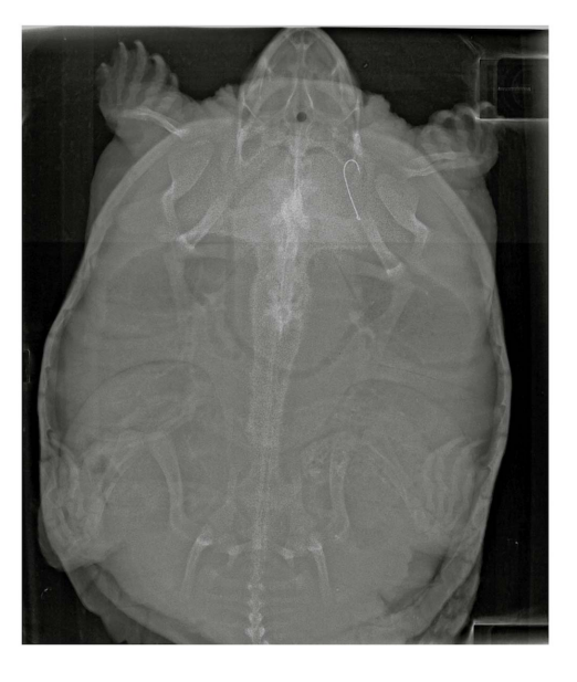
Figure 2. X-ray of a Snapping Turtle ( Chelydra serpentina ) captured in Tennessee containing a fish hook. Image has been enhanced to improve hook visibility. doi:10.1371/journal.pone.0091368.g002