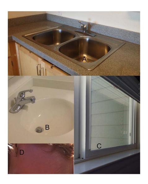
Figure 1. The Study Sites for Surveying Fungi in Residential Units of a University Housing Complex. Pictured are three surface types on what cotton-tipped swabs collected material for fungal analysis. Biofilms were collected on three types of drains: kitchen sinks (A), bathroom sinks (B), and bathtub drains. From the upward-facing edge of windowsills in kitchens, living rooms, bedrooms (C), and bathrooms, dust was also collected. Skin samples were taken from the forehead (D). Fungi on these surfaces were compared with each other and with passively settled indoor and outdoor dust from the same sampling locality [10]. doi:10.1371/journal.pone.0078866.g001

Genomic DNA extraction relied on the MoBio PowerSoil Kit (Carlsbad, CA, USA) with some modifications following Fierer et al. [21]. Using scissors that had been immersed in ethanol and flamed, the cotton head of the swab was cut directly into the provided PowerBead tubes containing solution C1. The tubes were incubated at 65 °C for 10 minutes and vortexed horizontally for 10 minutes, after which manipulations followed the recom-