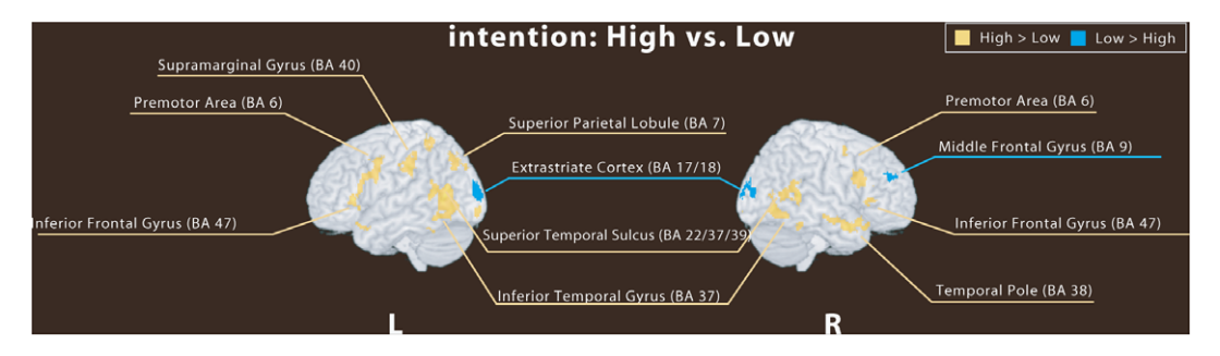
Figure 3. Brain activation regions for high—low-intention corresponding to the social brain (i.e., yellow area) and areas for low—high-intention corresponding to the perceptual brain (i.e., blue area). Event-related fMRI results showed that main activation areas occurred in three regions while participants observed low-intention animations: extrastriate cortices including calcarine sulcus and lingual gyrus (BA 17,18), and right middle frontal gyrus (BA9). During high-intention animations, activation of more widespread regions was observed, including: bilateral inferior frontal gyrus (BA47:IFG), premotor (BA6:PM), superior temporal sulcus (BA22/37/39: STS), inferior temporal gyrus(ITG), left superior parietal lobule (BA 7: SPL), and right temporal pole (BA38:TP). doi:10.1371/journal.pone.0049053.q003

tapping mentalization and agency attribution activated the same brain regions in the STS and temporo-parietal cortices including the supramarginal gyrus, inferior temporal gyrus, the temporal pole, and the SPL. One explanation for why we did not find activation in the MPFC is that we used an event-related design to avoid expectancy with a much shorter presentation time than the 30 s previously reported [12]. Expectancy cueing and longer presentation time could also yield possible contingent activations in the MPFC in addition to controlling intentional bias in the STS. It is highly possible, therefore, that higher-intention-involved animations, such as the fight between the blue and green triangle used in the current study, was perceived by the observer as though he/she was participating in the action against an antagonis. Indeed, humans may possibly detect intentions in shapes, even when those shapes change their motion to face another object [9].