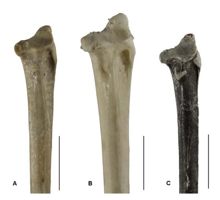
Figure 2. Comparison of the anterior view of the proximal end of the ulna. A, Gypohierax . B, Necrosyrtes . C, Anchigyps voorhiesi gen. et sp. nov., holotype (UNSM 62877). Scale bars equal 2 cm. doi:10.1371/journal.pone.0048842.g002

The left tibiotarsus (Fig. 1E-H) is nearly complete preserved except the proximal end. Crista cnemialis cranialis is relatively long, with its distal end reaching the proximal end of the crista fibularis (Fig. 1E), a feature of most non-vulturine accipitrids. Unlike modern large sized accipitrids, such as Aquila , the distal part of the crest is much lower and the proximal part directs outward in Anchigyps voorhiesi. The crest nearly parallels the shaft in extant Old World vultures, but only the distal part of the crest does so in Anchigyps voorhiesi. The crista cnemialis lateralis is as long as the cranial crest, although lower. Sulcus intercnemialis is narrow and shallow, judging from the direction and the morphology of the crests. Facies gastrocnemialis is relatively broad. Crista fibularis is long, bladelike, and more protrudent distally than proximally. The shaft of the tibiotarsus is straight, robust and nearly circular in cross section at the mid-point; this characteristic can be observed in most Old World vultures, but is absent in non-vulturine