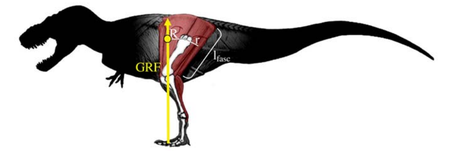
Figure 1. Schematic of extensor fascicle length ( I_{fasc} ), the GRF vector moment arm (R; segmental gravitational, but not inertial, moments were also included but not shown here; see [48]), and the extensor (antigravity) muscle moment arm (r) for the hip joint. These parameters were calculated at midstance for the antigravity muscle groups at the hip, knee, and ankle, and combined with step length (estimated from hip height) to estimate the volume of muscle activated per meter travelled ( V_{musc} ); see Methods. Joint angles and position of the center of mass (yellow circle) are taken from Hutchinson [40]. Adapted with permission from original artwork by Scott Hartman. doi:10.1371/journal.pone.0007783.g001

Phylogenetic analysis of our data supports the hypothesis that an endothermic level of metabolism was needed to power at least slow running gaits in all Dinosauriformes (Figure 3). If a conservative approach is taken, using only locomotor cost estimates for slow walking, for which our two methods identify the same set of taxa as endothermic, then the hypothesis that endothermy arose independently at least three times (in Sauropodomorpha, Tetanurae and Neornithes) and was lost once (in Coelurosauria) is favored. This is at odds with insulatory and histological evidence for endothermy at least in coelurosaurs (14,15,18,19,20,22), but would correspond to some degree of coevolution of advanced ventilator structure, large body size and endothermy. An alternative, less conservative approach, using locomotor cost estimates for moderate speed running from our simple hip height-based