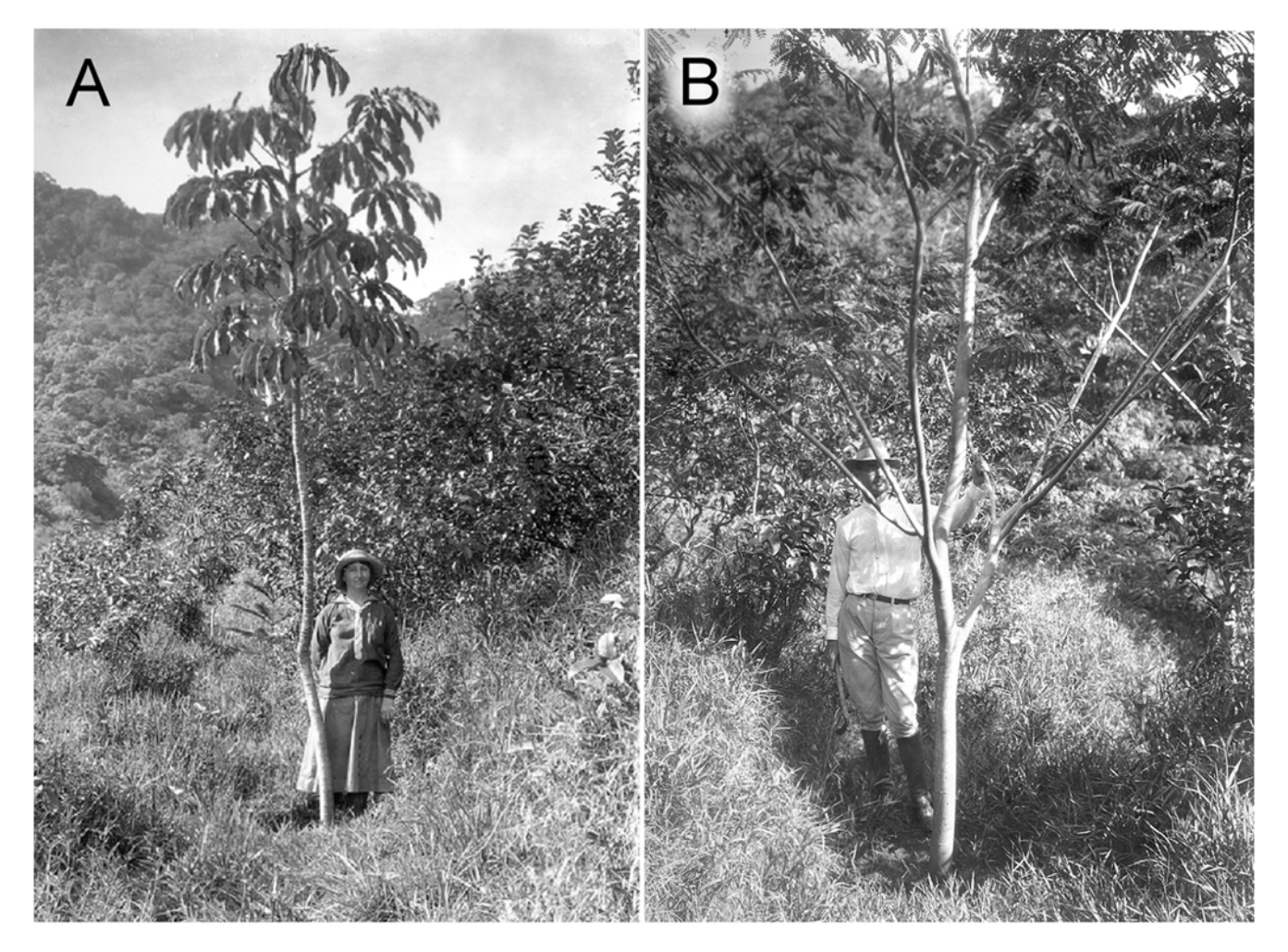
Figure 1. Cecropia obtusifolia (A) and Falcataria moluccana (B) are examples of early plantings in the Manoa Valley that became invasive. Natural or semi-natural vegetation is visible in the background of both photos, less than 500 m from these plantings. Photos: E. Caum, 31 December 1922.