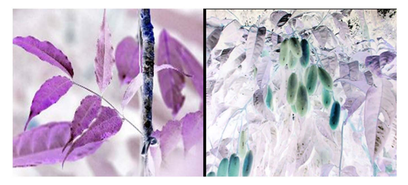
Figure 1. Photos of Fumbwa leaves (A) and Africanum pear Safou fruit (B). doi:10.1371/journal.pone.0049411.g001

separated the blood samples at LOMO Medical Laboratory within 45{-}60\, min.