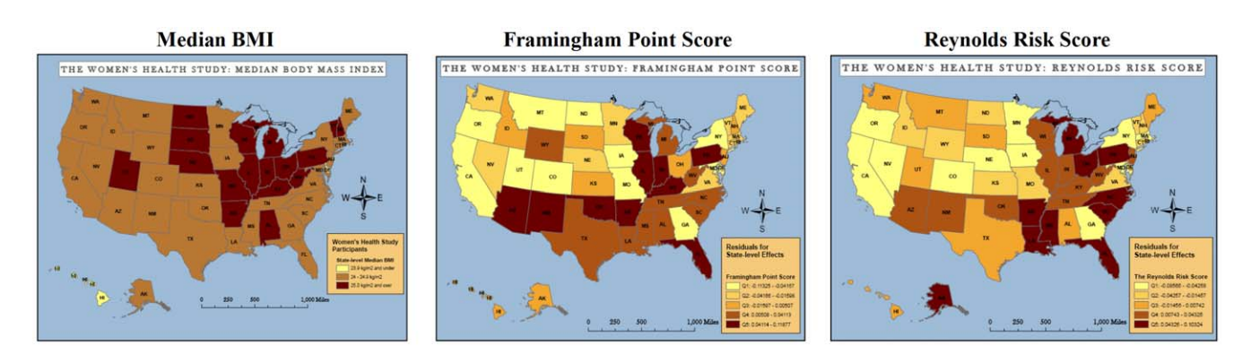
Figure 3. State-level Variation in Cardiovascular Risk Scores and State Median BMI in the Women's Health Study. Abbreviations: Q1: Lowest quintile of risk; Q5: Highest quintile of risk. Models not adjusted for covariates. doi:10.1371/journal.pone.0027468.g003

Table 1 presents biomarker levels, clinical and lifestyle data on all study participants, as well as state-level distributions of these characteristics, from the 1<sup>st</sup> to the 99<sup>th</sup> percentile. Among states that were well-sampled, the full distribution of median hsCRP values had a clinically significant range of moderately-low risk values (1.3 to 1.6 mg/L in Iowa, Massachusetts, and New York) to moderately-higher risk values (from 2.5 to 2.7 mg/L in Texas, Louisiana, Alabama, Arkansas and West Virginia). The lowest state-level values for both sICAM-1 (325 ng/ml) and fibrinogen (322 mg/dL) were seen in Iowa. The highest state-level values were seen in Arkansas for both sICAM-1 (366 ng/ml) and