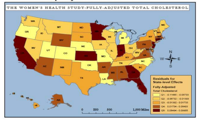
Fully-Adjusted Total Cholesterol