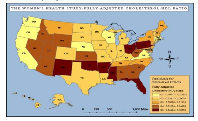
Figure 2. State-level Variation in Cholesterol in the Women's Health Study. Source: Women's Health Study Participants. Abbreviations: Q1: Lowest quintile of risk; Q5: Highest quintile of risk. Fully-adjusted models include: age, race/ethnicity, obese/overweight status, systolic blood pressure, diabetes status, smoking, exercise, caloric intake. doi:10.1371/journal.pone.0027468.g002

All statistical tests were computed in SAS 9.2 (SAS Institute Inc., Cary, NC). Maps were created in ArcGIS ArcMAP software version 9.3 (ESRI, Redlands, CA).