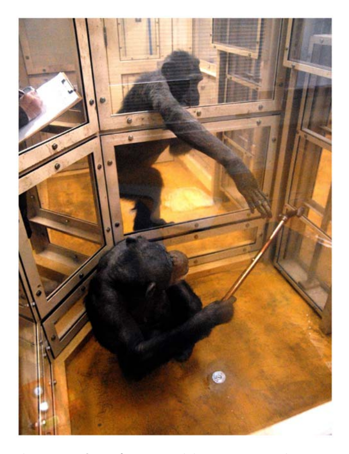
Figure 2. Tool transfer upon recipient's request. A chimpanzee (Mari) in the near-side booth picks up a stick and hands it over to her partner (Pendesa) in the far-side booth who requested the tool by poking her arm through the hole between the booths. doi:10.1371/journal.pone.0007416.g002

Observation of partner's struggle to obtain the juice without the use of a tool (only observed in the stick tool situation) did not elicit voluntary tool transfer. Stick possessors observed the partner reach out for a juice container without a stick in 47 trials, and of these 47 trails, voluntary transfer occurred 7 (14.9%) times; in other words, at a similar rate as that recorded overall (14.7%) (Chi-square test: \chi^2 (1)=0.001, p=0.97). Since no participant tried to obtain the juice without a tool in the straw-use situation, we could not conduct this analysis for straw transfer.