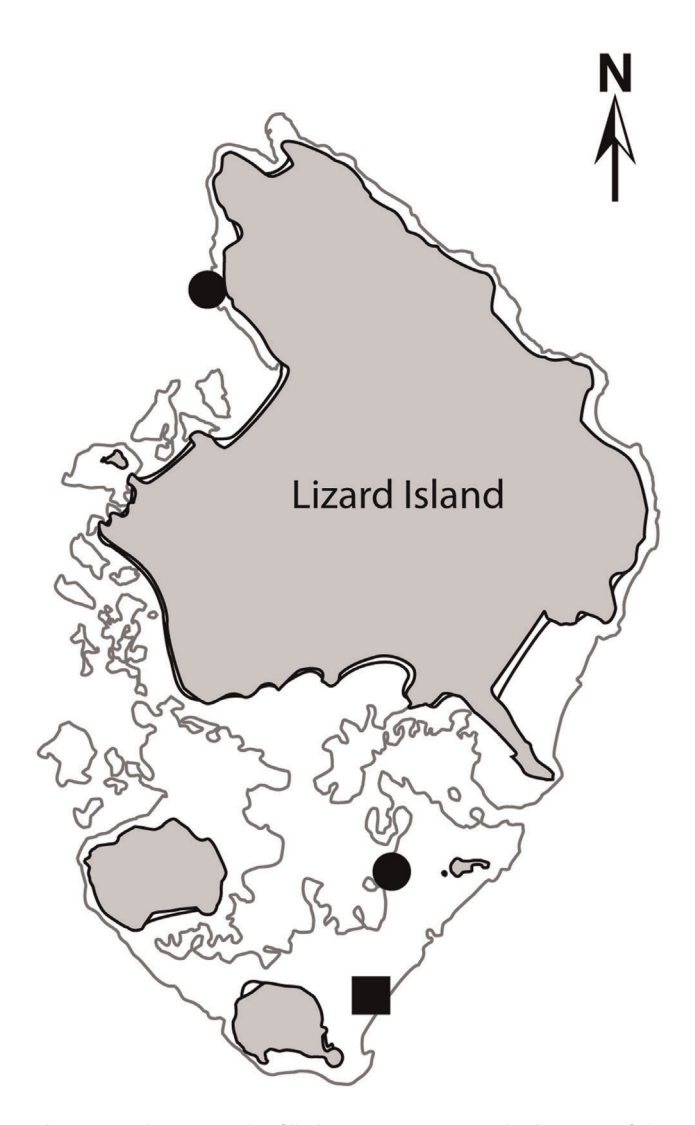
Figure 1. Site map. The filled square represents the location of the sediment removal study, where green turtles ( Chelonia mydas ) were observed feeding. The filled circle to the north represents the sheltered reef base and to the south the back reef. At both sites hawksbill turtles ( Eretmochelys imbricata ) were observed feeding on transplanted Sargassum assays.

To quantify browsing intensity across the six habitats a series of macroalgal assays were conducted. Sargassum swartzii (Ochrophyta: Phaeophyceae) was collected from an inshore reef in the