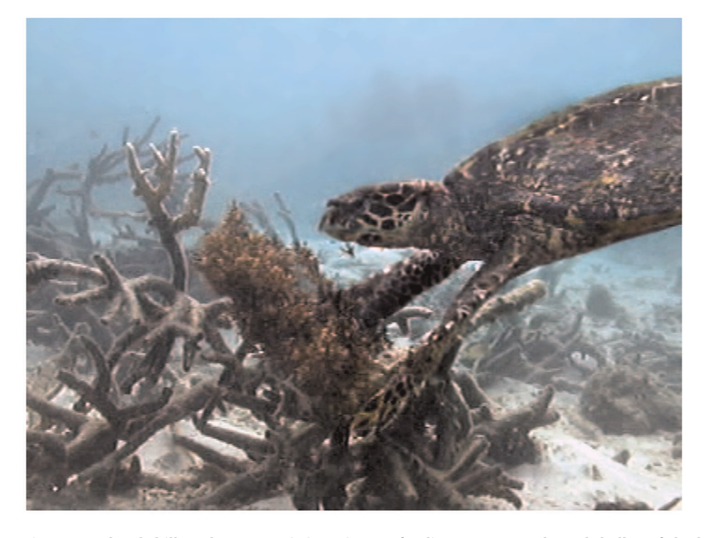
Figure 3. A hawksbill turtle ( Eretmochelys imbricata ) feeding on a transplanted thallus of the brown macroalga Sargassum swartzii. doi:10.1371/journal.pone.0039979.g003

Numerous studies have advocated the importance of herbivory to reef health and resilience, focusing on the roles performed by herbivorous fishes [2–4,9,12,36]. Fishes, while undoubtedly playing a key role in reef processes, lack some important morphological and behavioural traits of larger organisms. Larger animals, having larger mouths, usually take larger, more forceful, bites, and as such may be expected to have greater functional impacts [43,44]. While the general scarcity of macroherbivores reduces the net benefits of size, larger individuals can offer greater