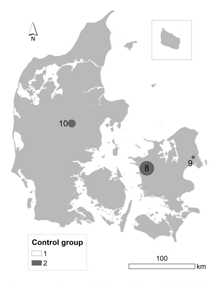
Figure 3. Map of space-only clusters of non-Hodgkin lymphoma in Denmark. One area showing statistically significant clustering of non-Hodgkin lymphoma cases (area no. 8), and two areas showing borderline clustering (area no. 9 and 10), based on spatial scan statistics of SaTScan and a maximum cluster size of 10% of the total population, using year when clusters were suggested by Q-statistics. None of these cluster regions were consistently found with both control groups. doi:10.1371/journal.pone.0060800.q003

However, SaTScan spatial scan statistics, which search for clusters using variable-sized scanning windows, were used to confirm any potential cluster suggested by the Q-statistics.