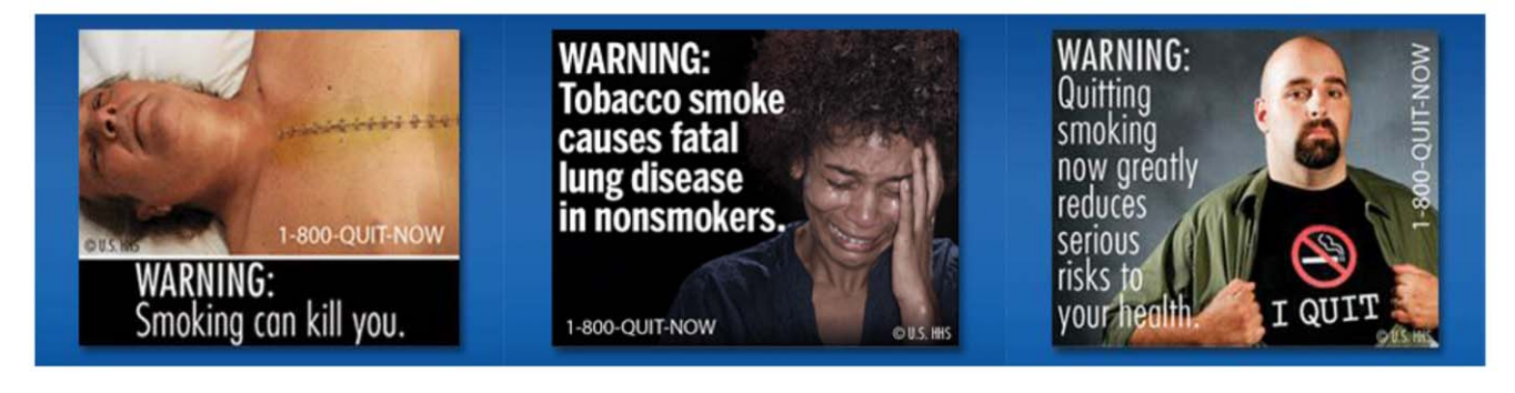
Figure 1. FDA-approved pictorial warning label images. This document includes images of the nine FDA-approved pictorial warning label images used in this study. doi:10.1371/journal.pone.0052206.g001

categories: ready to quit in the next 30 days, the next 6 months or not ready to quit, and was dichotomized as next 30 days vs. next 6 months/not ready.