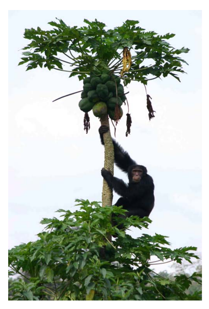
Figure 1. An adult male chimpanzee obtains cultivated papaya fruit. doi:10.1371/journal.pone.0000886.q001

divisible, and adult males are most likely to share such foods obtained in exposed locations and in the presence of local people (which is also associated with increased levels of arousal). As