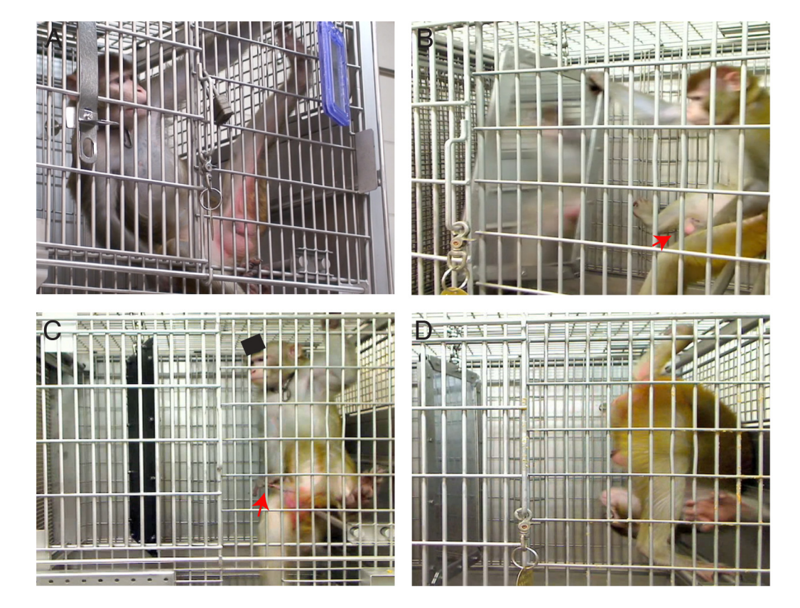
Figure 4. Example of monkeys examining their genital area in front of the mirrors. The red arrows point to the manipulation of the genitals (B,C). (D) Acrobatics such as this were commonly observed during inspection of genital area. doi:10.1371/journal.pone.0012865.g004

Sometimes they used one hand to hold the mirror in place (Fig. 4B) and moved or manipulated their genitals (Fig. 4B,C), while other times they performed acrobatics in what appear to be an effort to obtain a better view (Fig. 4D and Movies S4, S5). These observations are consistent with another of Anderson's [19] assertions concerning mirror-guided behaviors that are indicative of self-recognition and could be categorized under Povinelli et al.'s [20] classification of self-exploratory behavior used as a positive