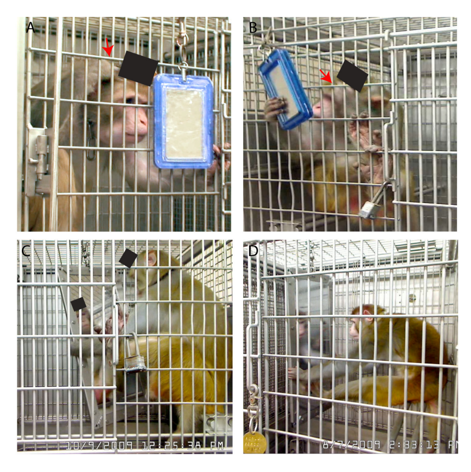
Figure 1. Examples of monkey self-directed behaviors in front of the mirror. (A,B) images from video recordings taken over the course of approximately eight months following initial observations. In each photograph the hand used for grooming is highlighted with a red arrow. In (A) the monkey leaned to his left while sitting on the perch to be able to look at himself in the mirror. In (B) The same monkey held the mirror at the appropriate angle for viewing himself with the right hand while grooming the area around the implant with the left. (C,D) Self-directed behaviors with the large mirror from two other monkeys. View of the implants have been masked for discretion (A–C). doi:10.1371/journal.pone.0012865.q001

Since both monkeys had failed the mark test, it was imperative to design experiments around other objective measures of behavior that would allow us to determine if these monkeys exhibited self-recognition. Anderson [19] outlined the following criteria to objectively determine if an animal displays mirror selfrecognition: (1) the spontaneous development of mirror-guided self-directed behaviors, such as examining parts of the body that are unseen without the aid of a mirror, and (2) the disappearance