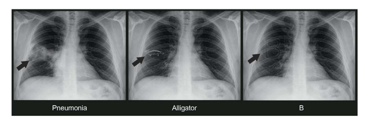
Figure 1. A trio of chest X-ray images with pairing of a lesion, an animal, and a letter*. *Arrows pointing to targets in the image; not present in the original images. doi:10.1371/journal.pone.0028752.g001

An important finding was that radiologists were able to cogitate differential diagnoses during the 3.5 seconds of a trial. A similar awareness of alternative names of other animals was reported while naming animals. In a few cases even letters evoked words to subjects (Table 1). Participants were not instructed to make differential diagnoses or to think about alternative names for animals during the task. These results are compatible with a fast and automatic semantic association process, in which the recall of a diagnosis or a name of an animal occurs with the concomitant activation of semantically related concepts [16,17,18]. Clearly, a formal and definitive diagnosis can not be made in seconds but its core cognitive process, the generation of diagnostic hypotheses which were the names of lesions in our study, is crucial for a final correct diagnosis [4,5,6,7,8].