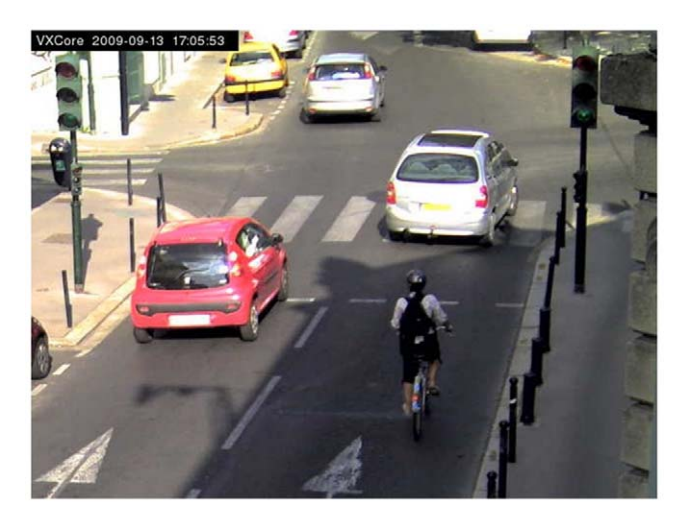
Figure 2. Picture of detected cyclist from behind at a 45 degree angle. doi:10.1371/journal.pone.0031651.q002

adjusted for helmet provison (OR [95% CI]). Significant estimates from Model 1 were analysed in a multivariate model (Model 2) and their interactions were investigated in a third model. Statistical analyses were performed using the SPSS statistical package, version 16 (SPSS, Chicago, Illinois, United States).