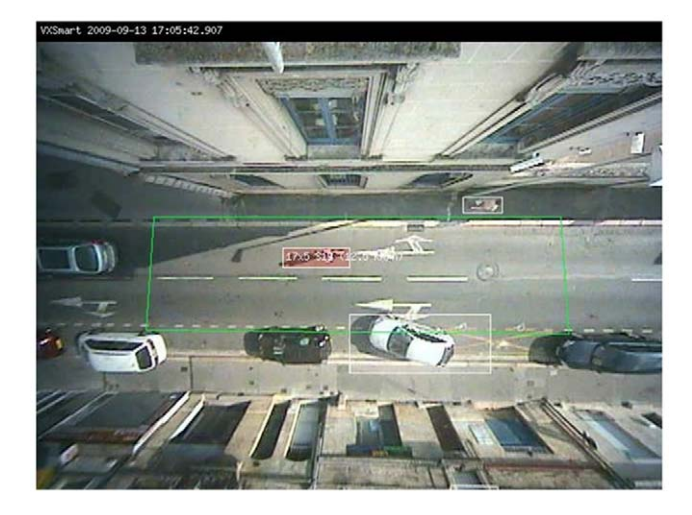
Figure 1. Capture of a cyclist's movements by a camera from a vertical angle. doi:10.1371/journal.pone.0031651.q001