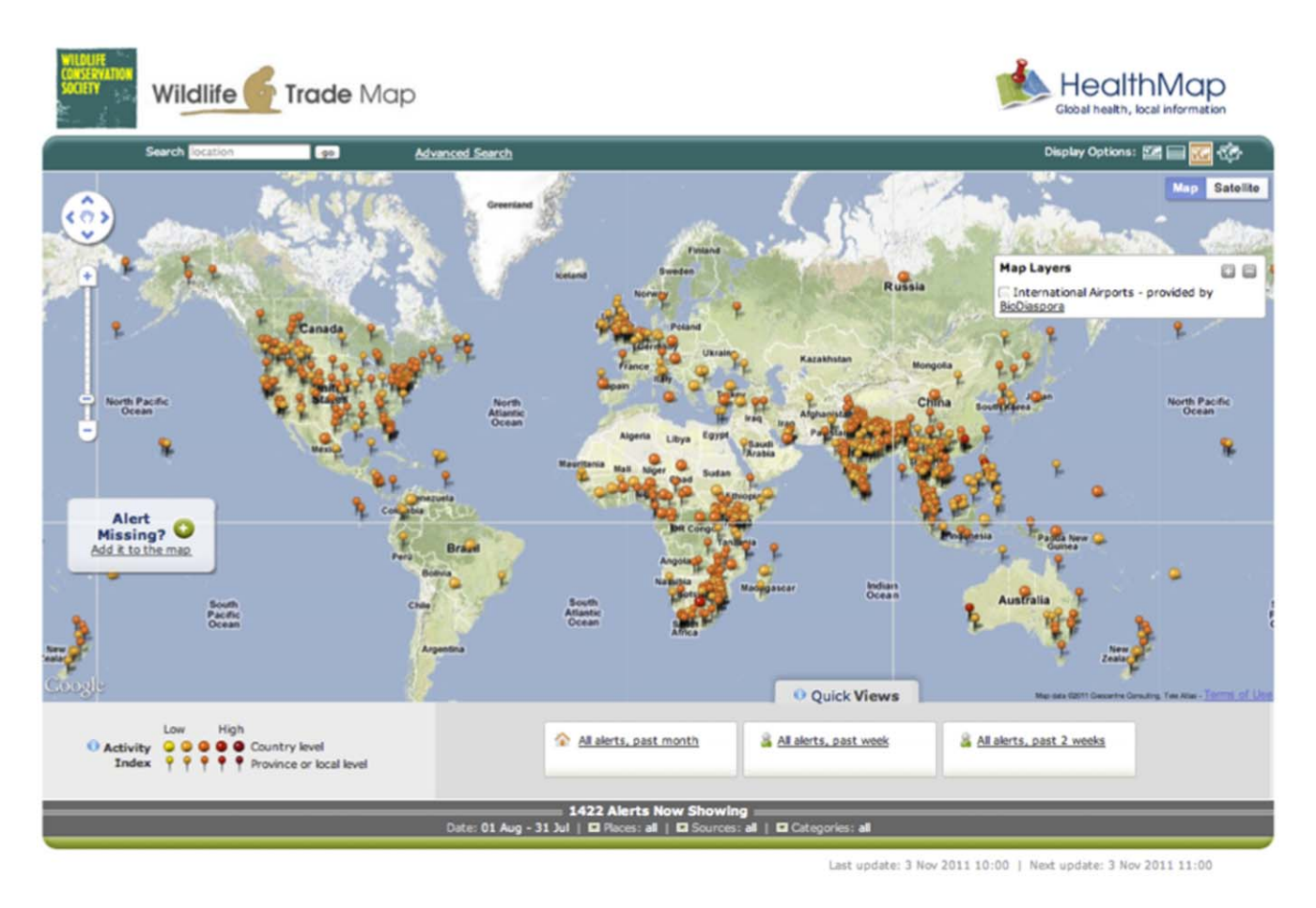
Figure 1. Wildlife trade website showing time period from August 1, 2010 to July 31, 2011. Illegal wildlife trade reports received through the automated system are shown with the orange pins. Screenshot taken November 3, 2011. www.healthmap.org/wildlifetrade. doi:10.1371/journal.pone.0051156.g001

may not be representative of the greater illegal trade picture. In addition, the query parameters had to be well-defined for each species of interest in order to obtain relevant search results, and query results had to be consistently reviewed by subject matter experts in order to determine if further action needed to be taken [7]. The sacrifice of sensitivity for specificity combined with its labor-intensive approach limited its scalability.